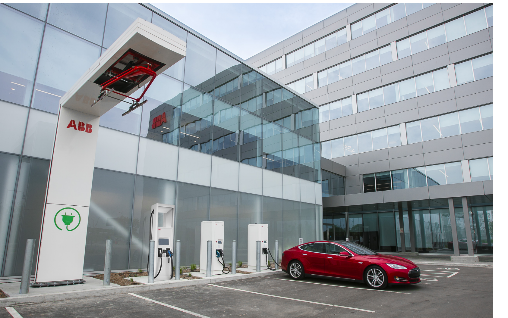
ABB Ability<sup>™</sup> Connected Services

Integrate with back offices and added value systems: