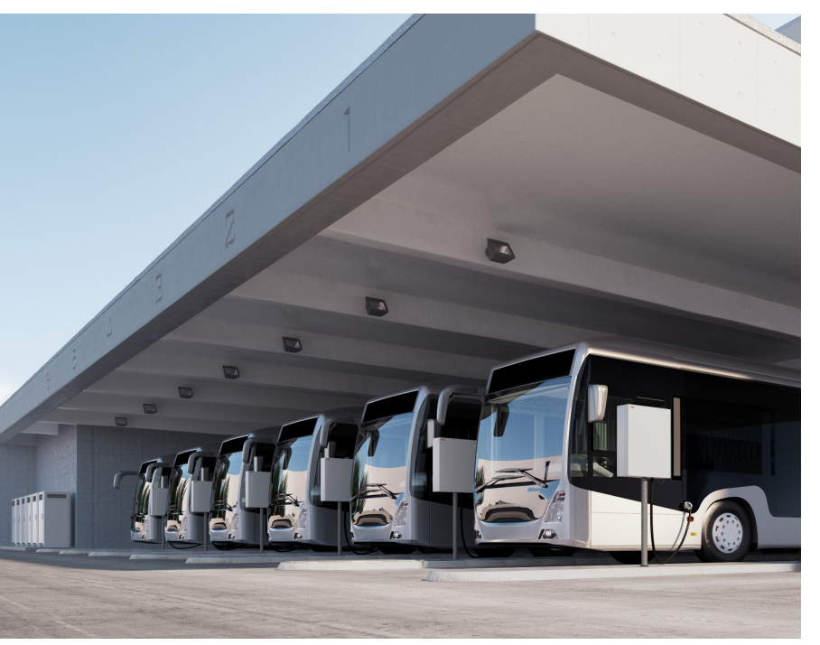
ABB offers a complete portfolio for charging heavy electric vehicles such as buses and trucks with a CCS connector. Due their large voltage range the DC wall box (24 kW) and Terra 54HV (50 kW) are perfectly suited to charge electric buses and trucks. For higher power the products with 100 kW and 150 kW including sequential charging, are specially designed to charge larger fleets of electric vehicles in it its most optimized way.

Charge electric buses and trucks with a connector