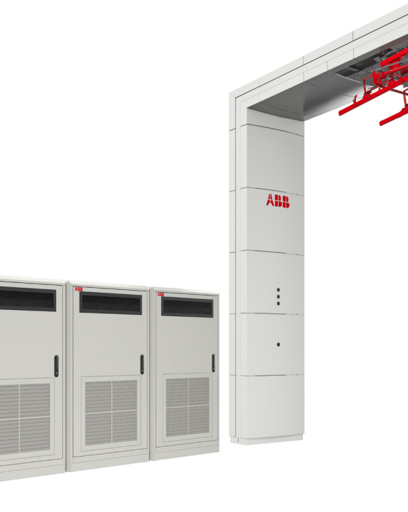
ABB Charger Care SLA

HVC-450PD with 450 kW power cabinet and standard charge pole