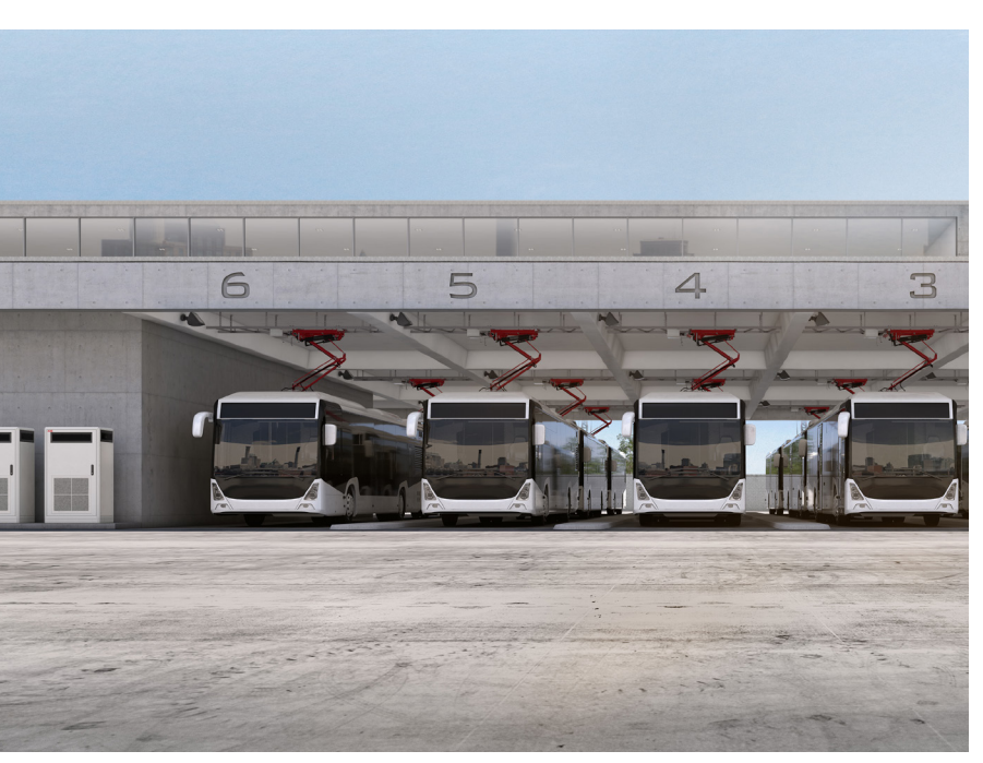
ABB offers an ideal solution to charge electric buses fully automated following the OppCharge protocol. With typical charge times of 3 to 6 minutes the system can easily be integrated in existing operations.